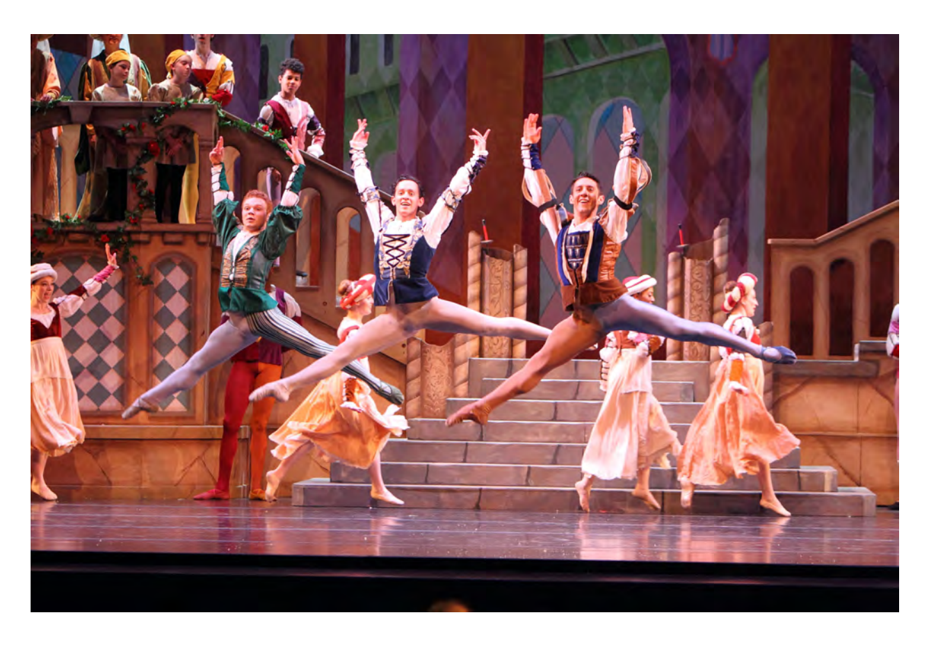
Benvolio, Romeo, and Mercutio