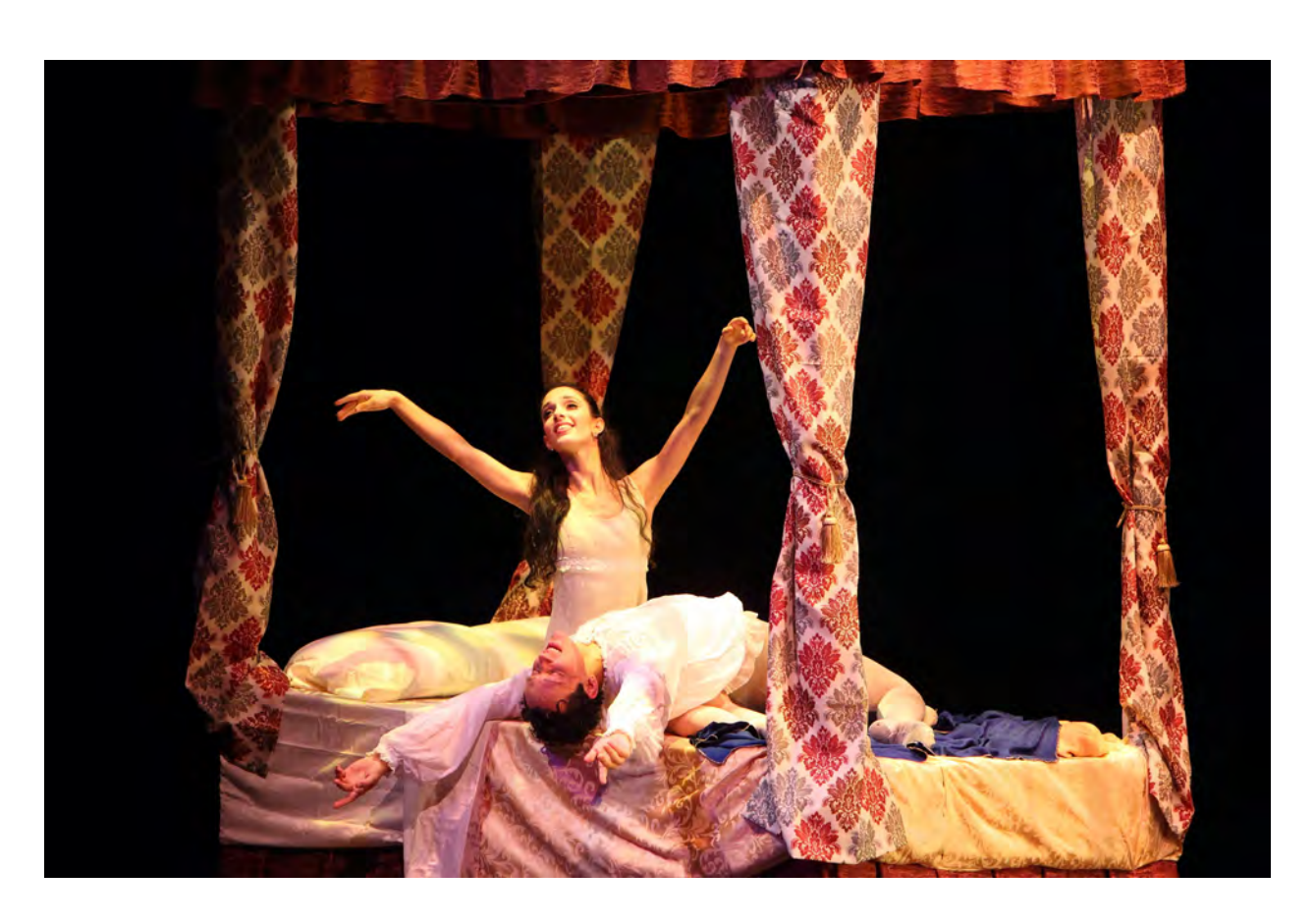
Juliet and Romeo Before Parting