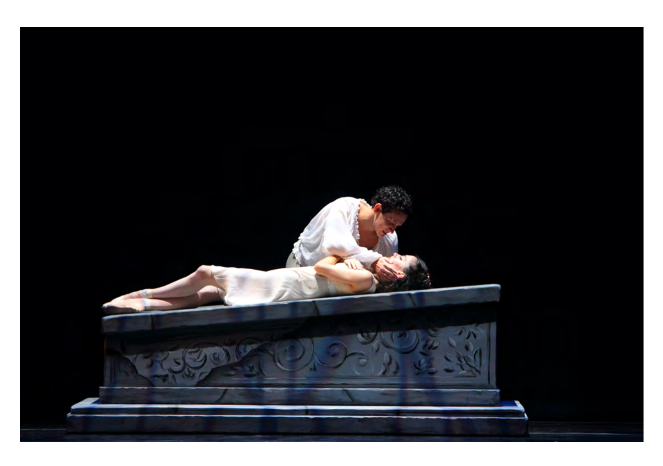
Romeo Discovers the Sleeping Juliet