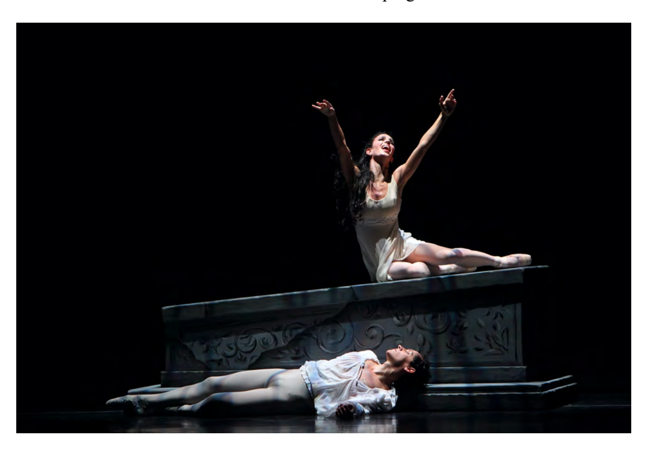
The Tragic Ending