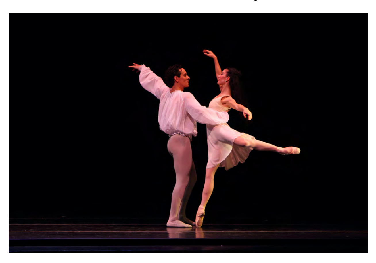
Romeo and Juliet