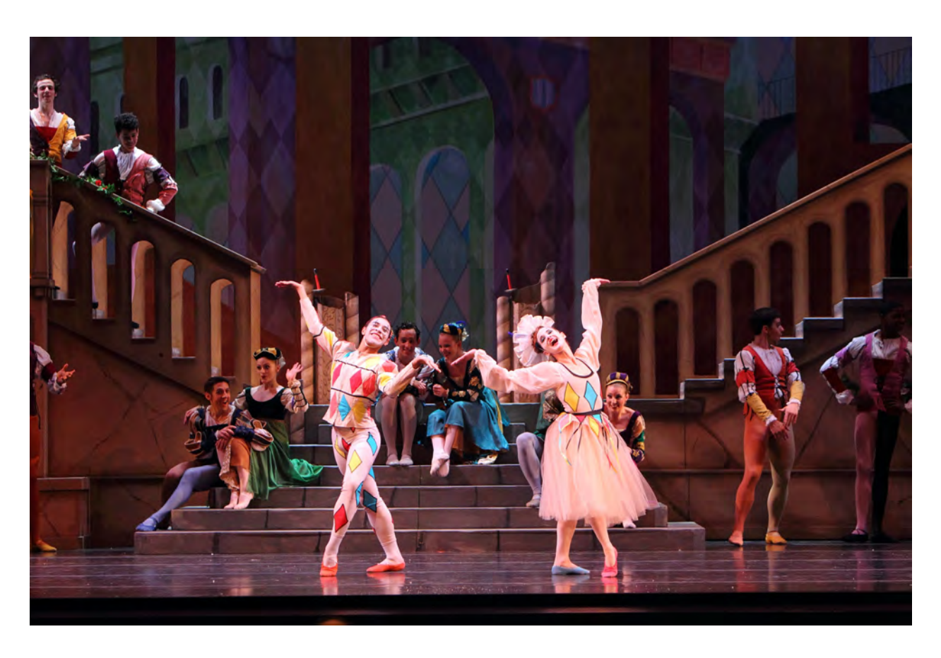
Commedia dell'Arte Performers